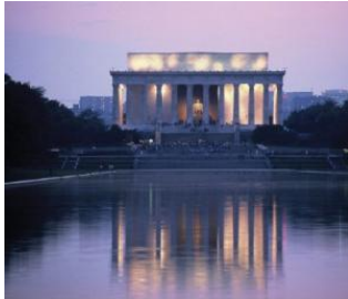
NASA and Me